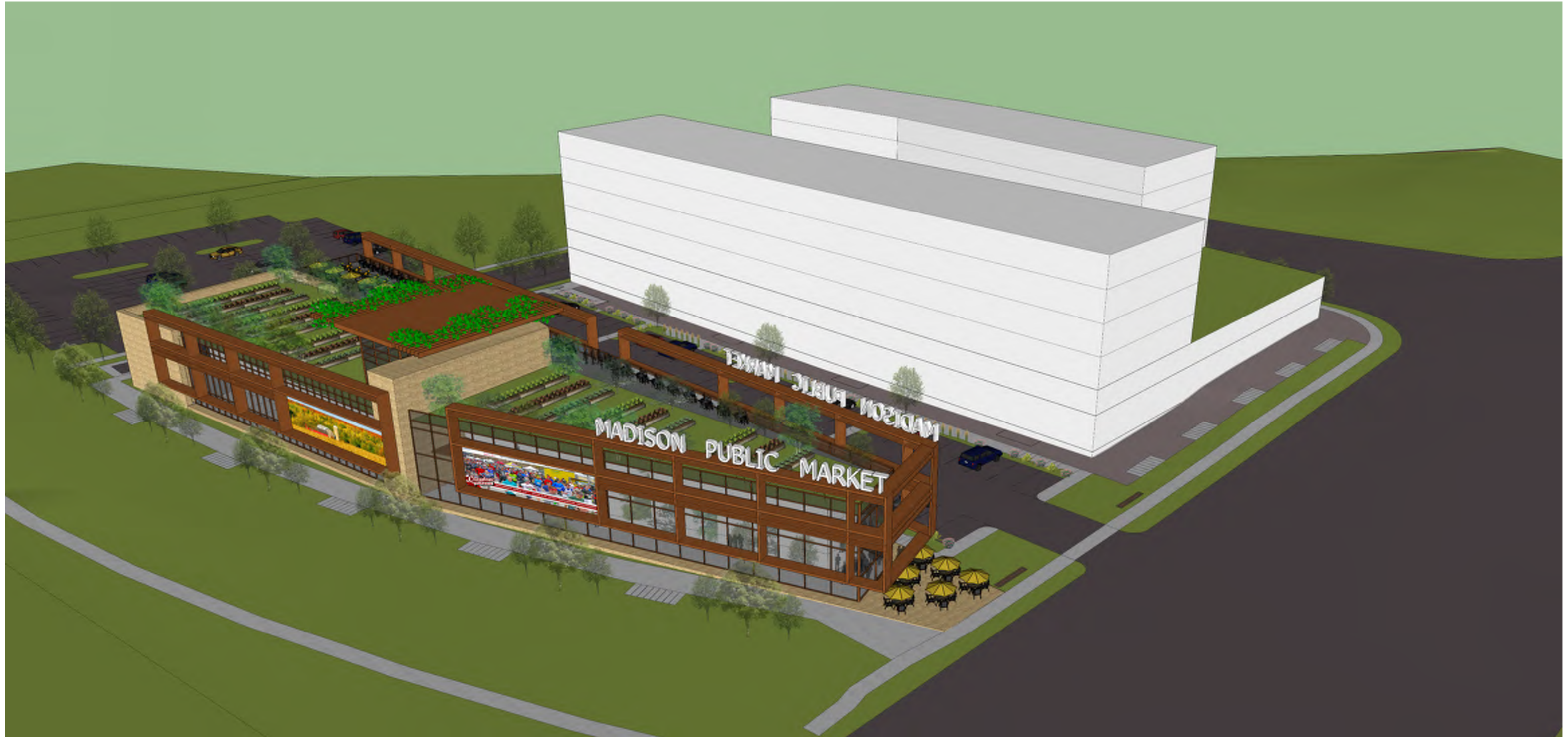
CONCEPTUAL AERIAL IMAGE SE - C