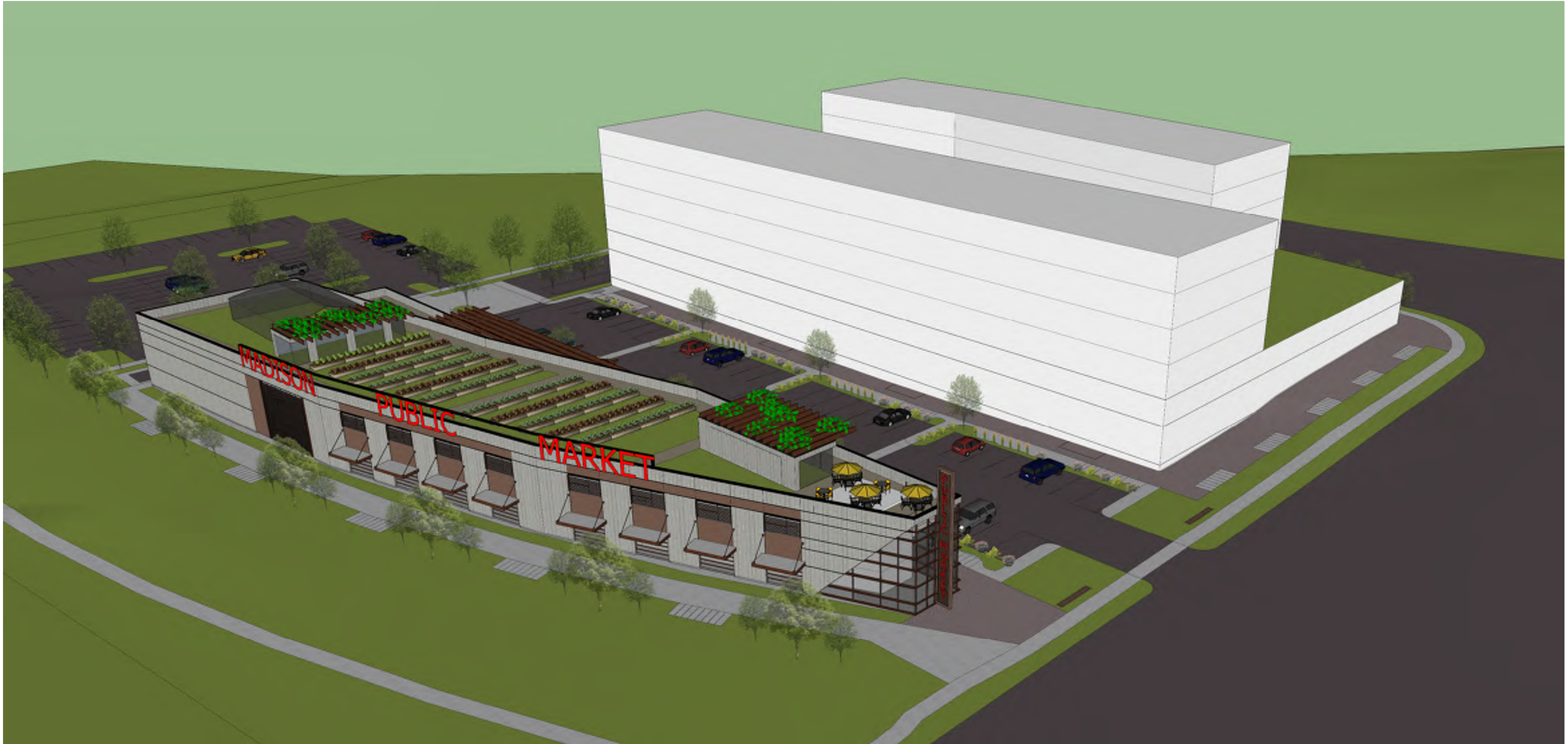
CONCEPTUAL AERIAL IMAGE SE - A