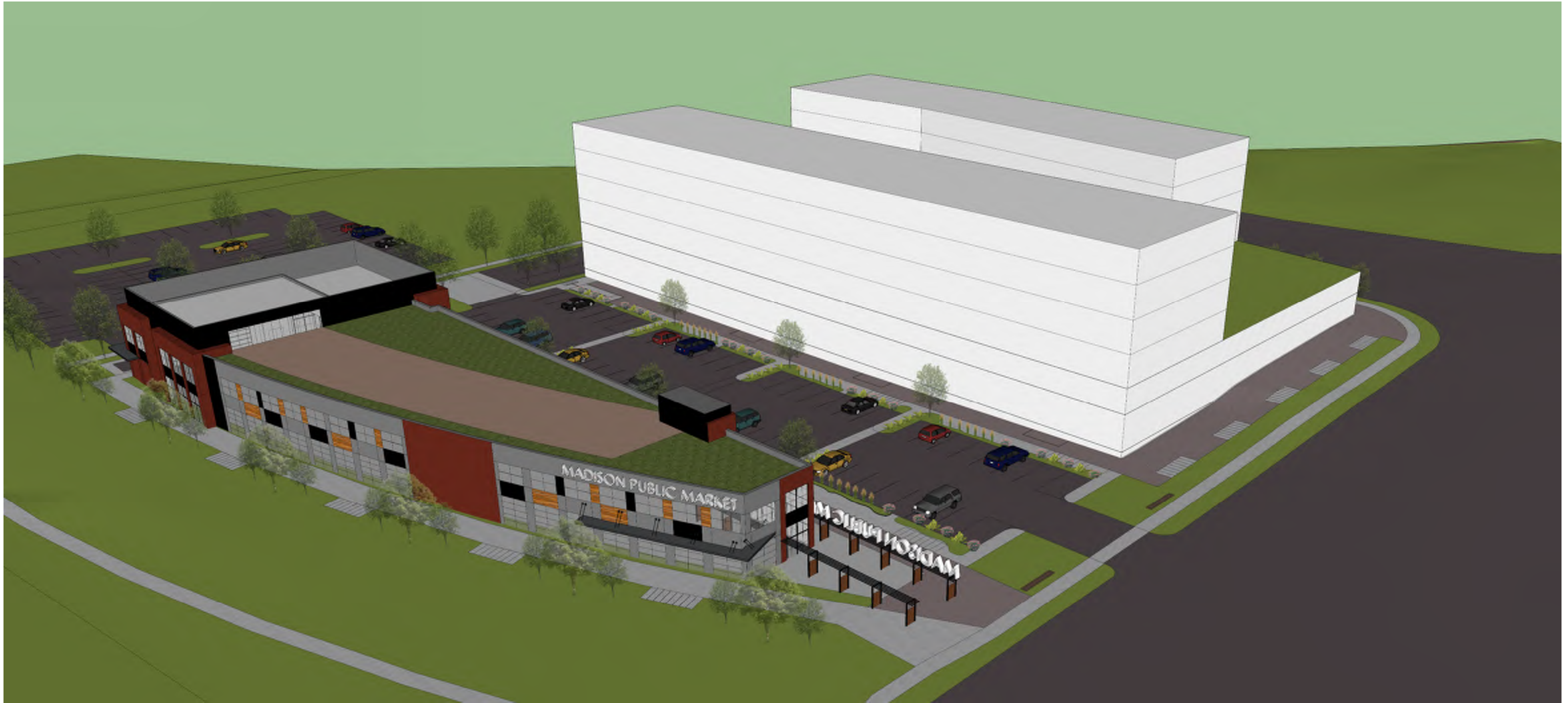
CONCEPTUAL AERIAL IMAGE SE - B